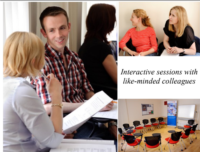
Interactive sessions with like-minded colleagues

The DELTM course is now entering its fourteenth year and has significantly contributed to the development of the careers of over 200 ELT professionals. Many former course participants have gone on to develop successful careers as Group Academic Managers, Principals and Academic Managers. Former participants include a past chair of Business English UK, an ELTON award winner and a popular English UK trainer and consultant.