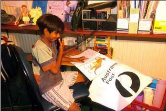
Australian Radio Schools