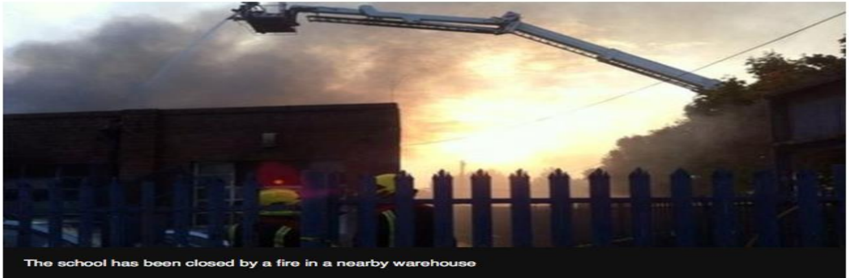
The school has been closed by a fire in a nearby warehouse

Pupils at a secondary school closed by a fire are learning online in what is being claimed as the UK's biggest virtual school experiment.