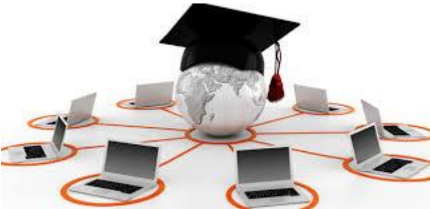
Online Resources and MOOCs