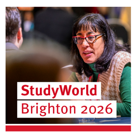
StudyWorld Brighton 2026 Monday 26 - Wednesday 28 January