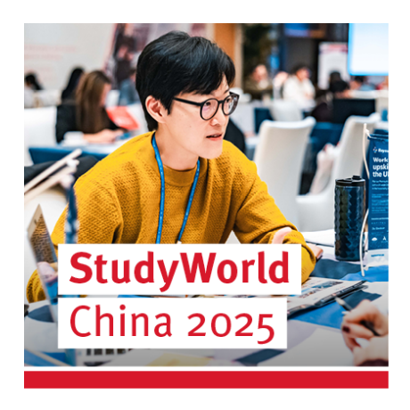
StudyWorld China 2025 Thursday 13 - Friday 21 November

Al in ELT: from theory to practice London | Friday 19 September 2025