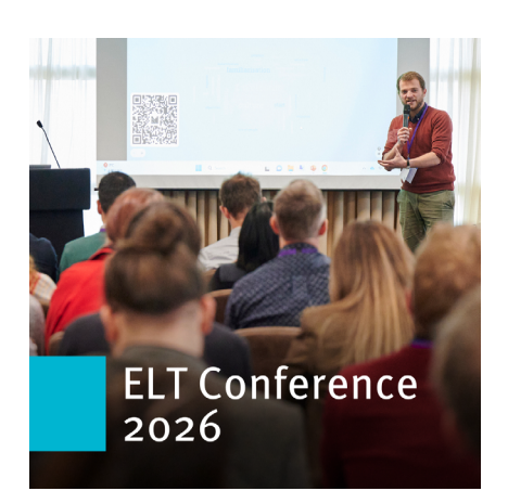
ELT Conference 2026 London | Friday 6 - Saturday 7 March